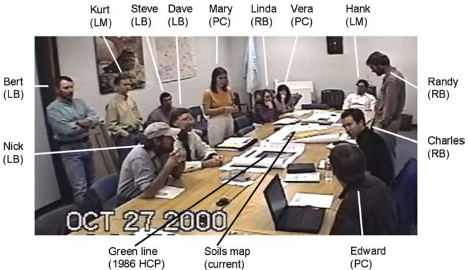
Figure 5. Seating order, participants and active map documents in SAC meeting to discuss conservation plan for an endangered lizard species in the valley. Different professional roles include plan consultants, regulatory biologists, local biologists, and land managers.

DAVE (LB): The hot red? Um, well, these are reflectance values that the computer sees from um, an Ekinos satellite image that’s forming a resolution using color, three color infrared . . . um scanning and it APPEARS based on my field checking and experience out there, that the RED areas are the areas with the most active and um LEAST compacted sand. And in areas within the