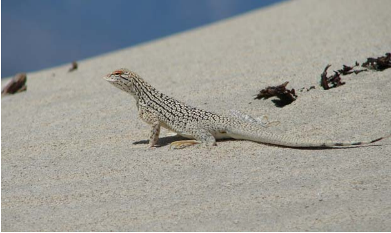
Figure 1. The Coachella Valley fringe-toed lizard, a federally listed endangered species.

SCIENTIST 2: They probably didn't have data.