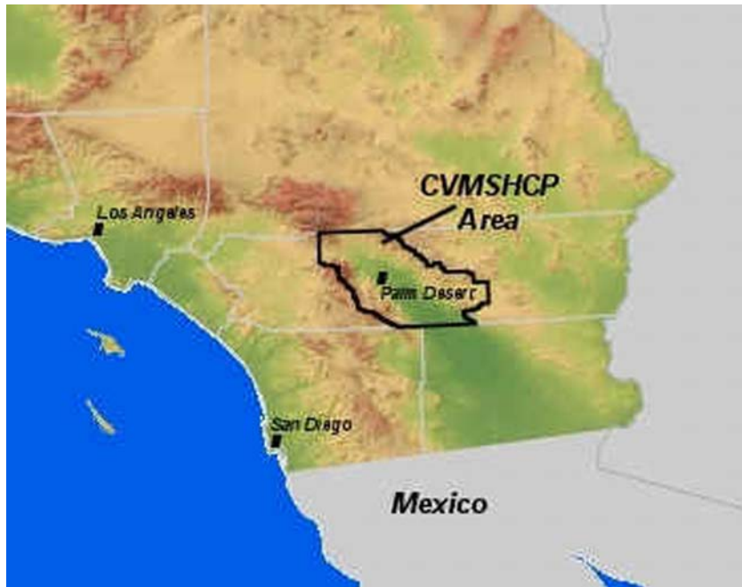
Figure 3. Locational map of the Coachella Valley Multispecies Habitat Conservation Plan area, prepared by the Coachella Valley Association of Governments (CVAG).

Why did the SAC designate a species model for the fringe-toed lizard that projected species movement over geologic time, rather than using projections of its current habitat, the standard employed for the other species in the plan? The answer is not a lack of data, because there was an abundance of information available for mapping its present distribution; indeed, far more data than was available for any other species included within the MSHCP. If this wasn't just shoddy science in action, can this episode teach us about how to assemble credible, legitimate, and authoritative knowledge claims, an increasingly common challenge in high-stakes collaborative planning efforts?