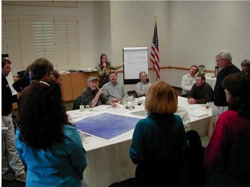
Figure 6. Meeting of the scientific review panel in Palm Desert, 12 February 2001.

by SAC biologists. On the second day, the panel was sequestered without SAC members present, where they reached rough consensus on the key issues and divided up tasks to prepare a formal review document that was released a few months after this meeting, during which time the panel scientists were prohibited from speaking to anyone in the valley. As described in the introduction to this paper, during this second day the panel scientists speculated that the FTL map was different from the other species maps because the SAC didn't have enough data. In their report, they asserted that the MSHCP's credibility was damaged by including species maps constructed according to different standards.