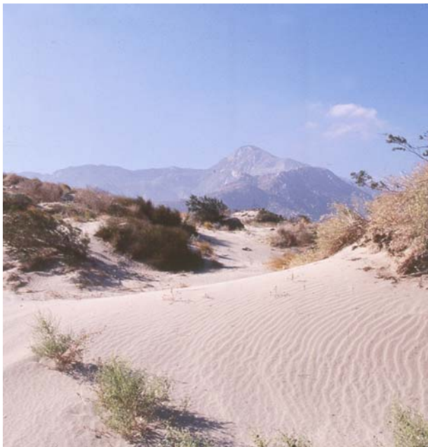
Figure 2. Active sand dune that a Coachella Valley fringe-toed lizard might use as habitat. The quality, geographic distribution, and dynamic history of sandy habitat was a sharply contested issue in this habitat conservation plan.

Some of the credibility of the ARD [administrative review draft of the MSHCP] is damaged by seemingly incongruous information presented in map form or omissions from the documentation.